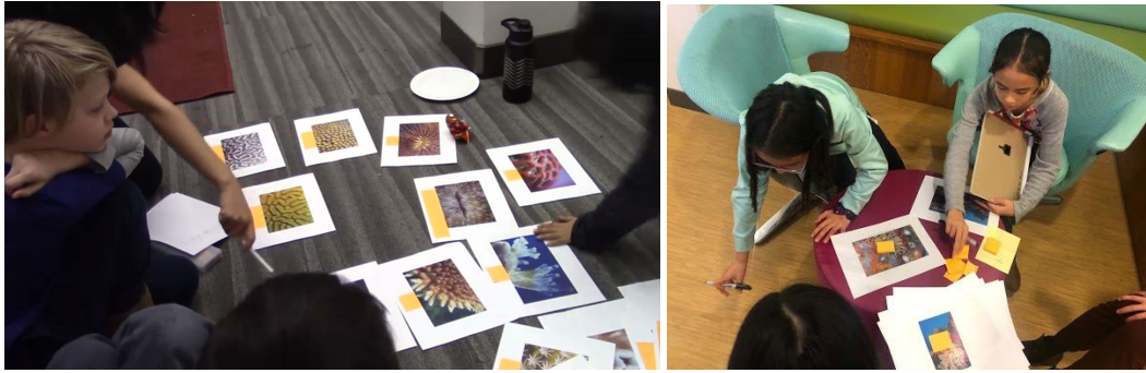
Figure 1. Study participants grouping images and discussing classification labels